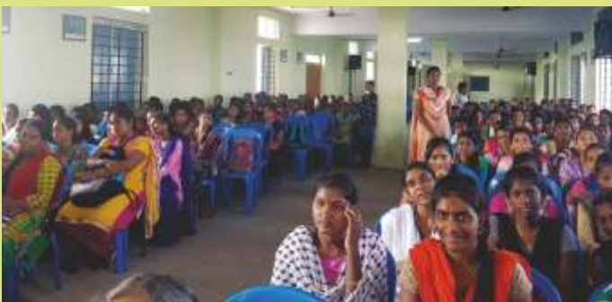
Rubella - Awareness Programme IWC of Madras Esplanade