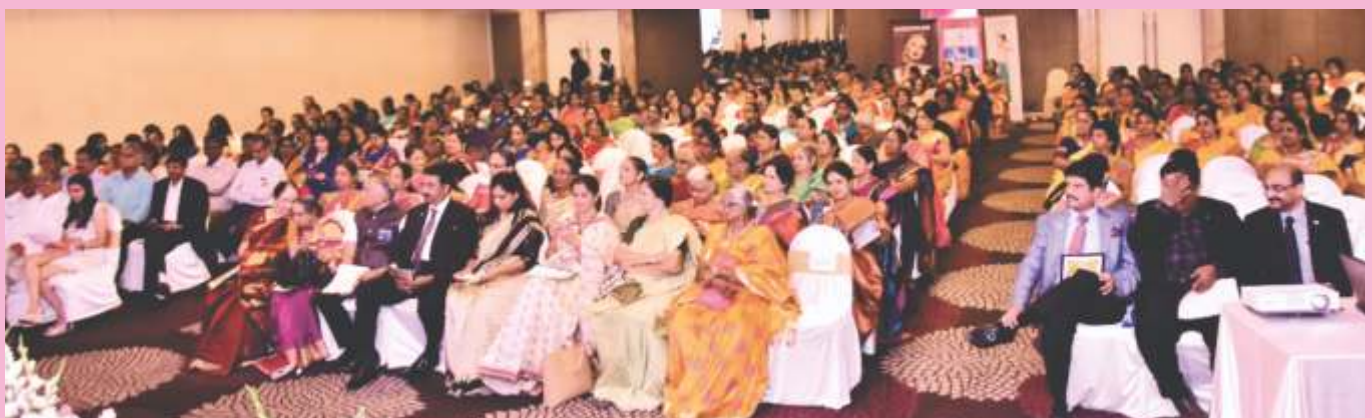
"Excellence is a continuous process and not an accident"