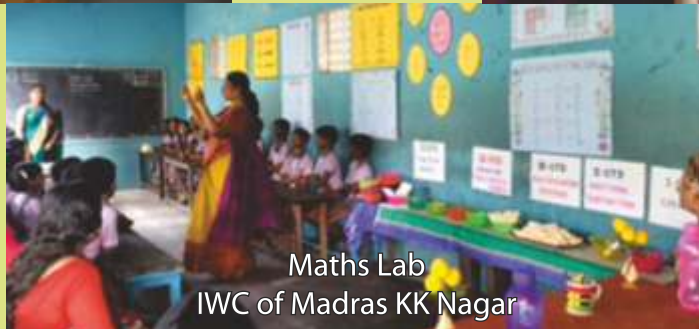
Maths Lab IWC of Madras KK Nagar