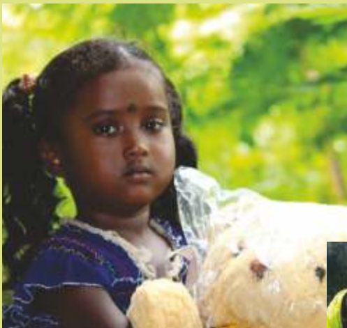
IRULAR OLI - IWC of Nanganallur - Joint project with 27 Clubs