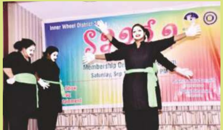
SAAGA - Jillunu Oru Payanam into Inner Wheel...

"The best way to make children good is to make them happy."