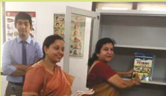
Library - IWC of Madras Ashok Nagar