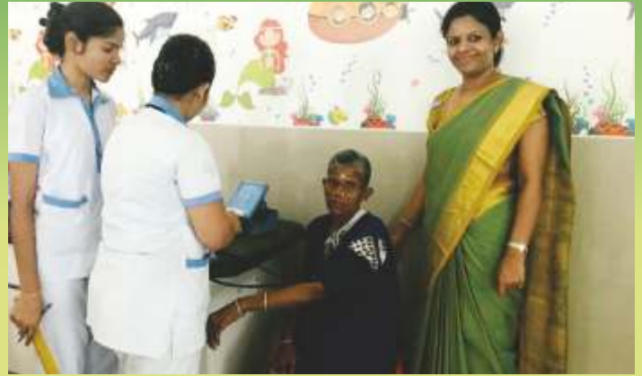
SUSHRUTA - Our Health & Wellness Programme