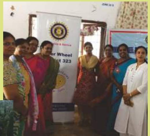
M.A.D (Making A Difference) with music by FMLRians