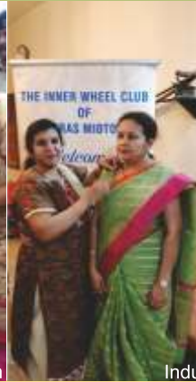
IWC of Madras Midtown