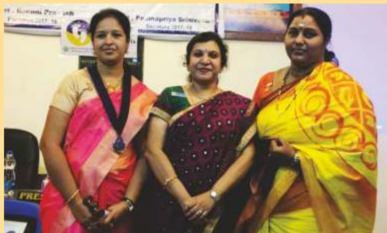
IWC of Ranipet

With the District tally coming to 46 Inner Wheel Clubs, my days were set with installations of Presidents and their teams, sometimes running to even two a day.