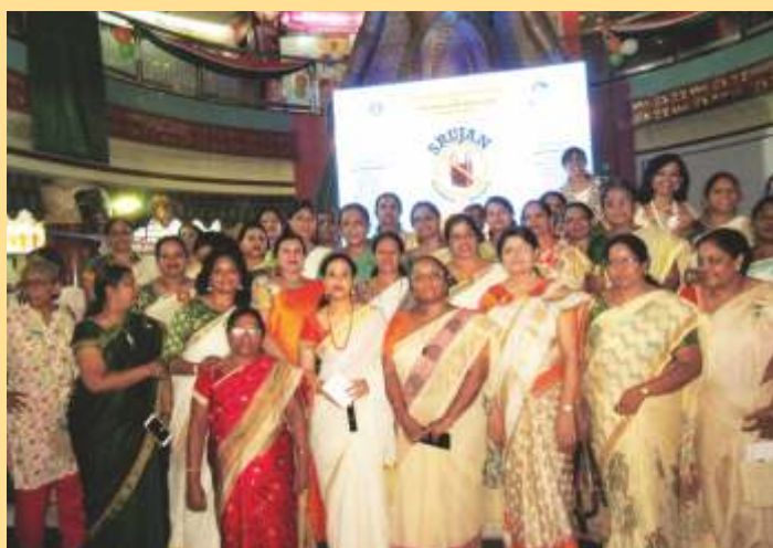
SRUJAN-Stop Plastics: Save Earth