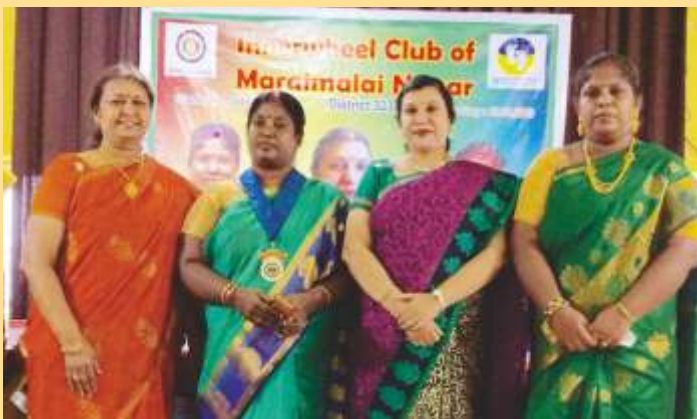
IWC of Maraimalainagar