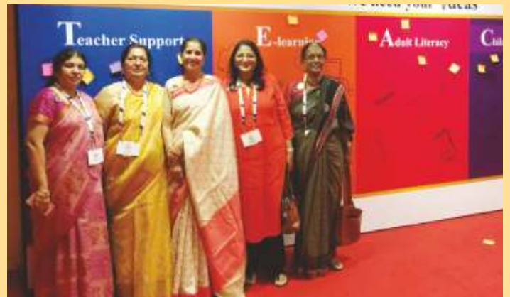
ROTARY SOUTH ASIA LITERACY SUMMIT