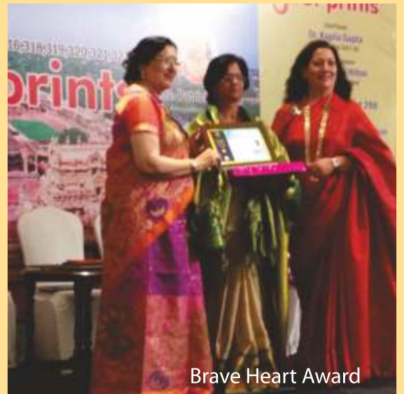
Brave Heart Award

With the show-casing of our unique projects and our enthusiastic participation in the Motor Rally, Ramp walk and Skit, we ensured that the footprints of IWD 323 were firmly entrenched in minds and in the Thanjavur soil, leaving behind only hoardes of appreciation and goodwill.