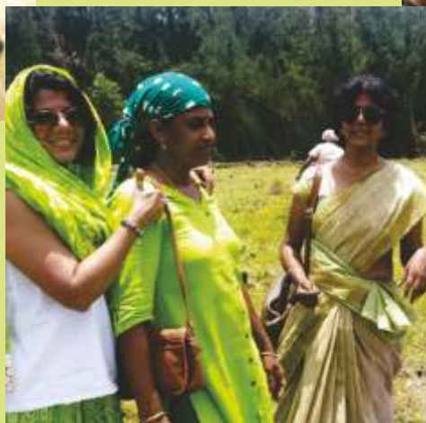
TIST: IWC of Adyar Joint project with 6 clubs