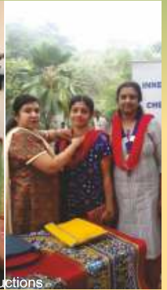
IWC of Chennai Galaxy