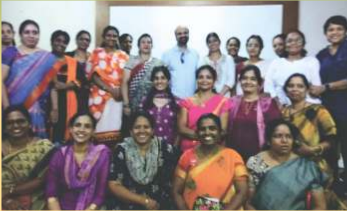
Our Golden Presidents at SAMATVA