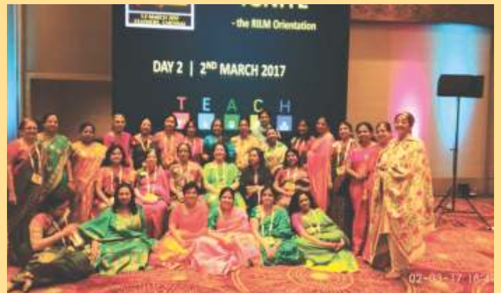
To IGNITE.. the SPARK in us