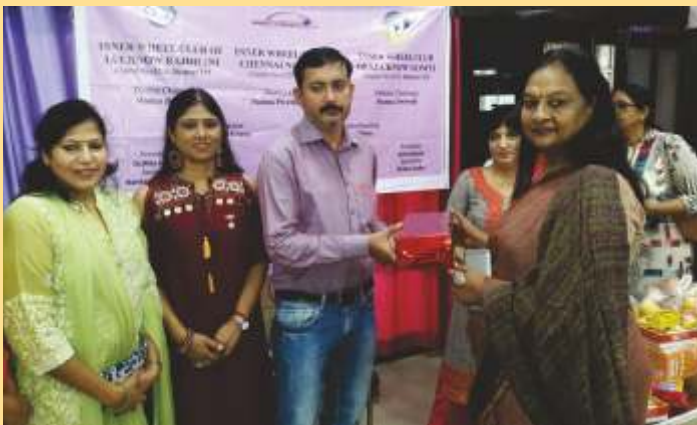
IWC of Chennai Nolambur - 2 Projects with Dist - 312 and Dist - 298