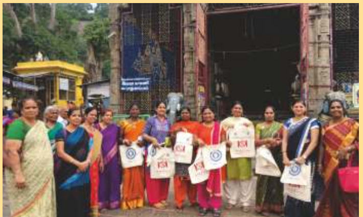
IWC of Nanganallur with Dist 321 promoting the brand Inner Wheel