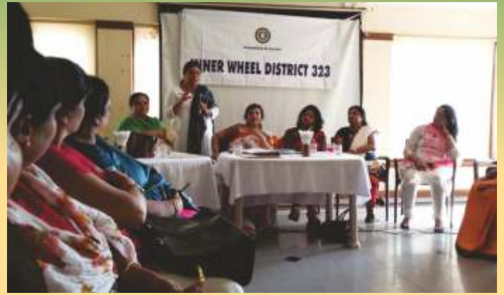
INFORMAL PRESIDENTS MEET