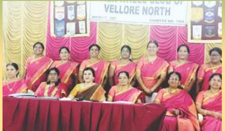
IWC of Vellore North