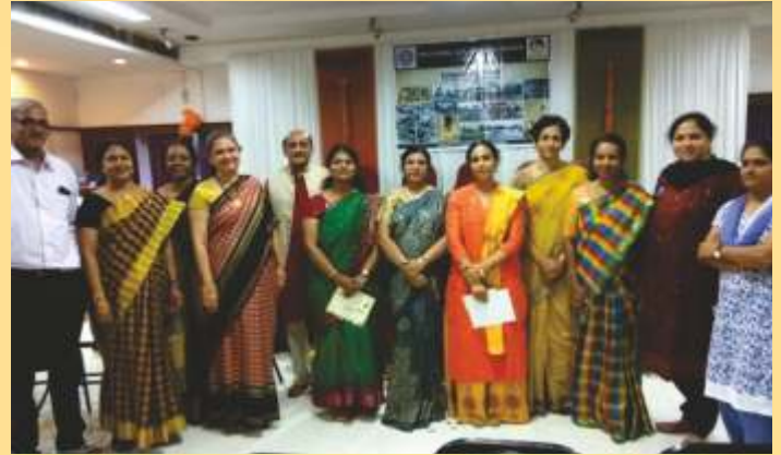
ExQuizIt - A Quiz Programme on Madras by IWC of Madras Midtown