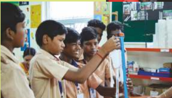
Physics & Bio Labs IWC of Madras Midtown & IWC of Chennai Verve