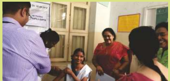
Rubella - Vaccination IWC of Chennai Gemini