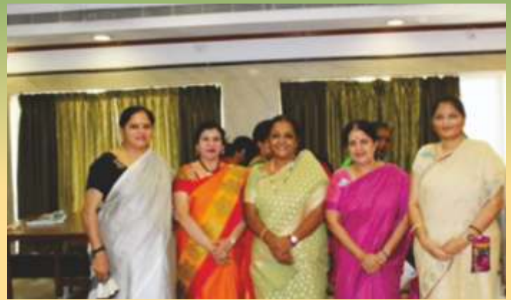
SRUSHTI - Briefing Programme