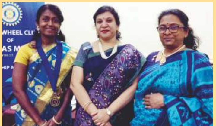
IWC of Madras Mount