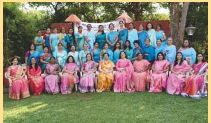
NAVDRISHTI - My Institute in Mahabaleshwar