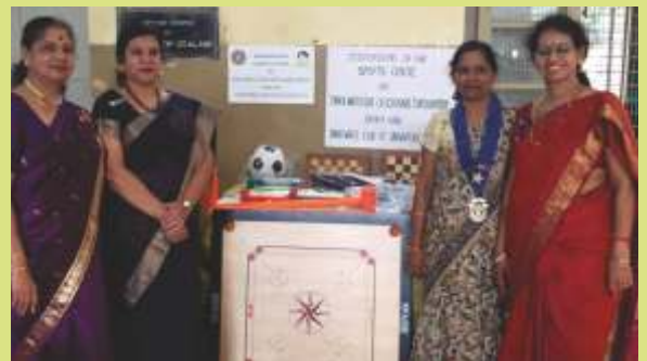
Sports Centre- IWC of Chennai Thiruvannmiyur