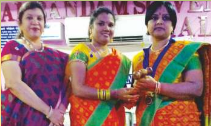
IWC of Kancheepuram