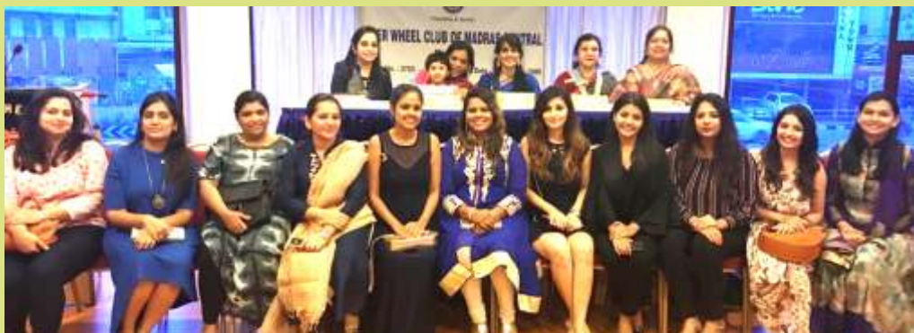
The newest baby to join the fold - IWC of Chennai Central Elite